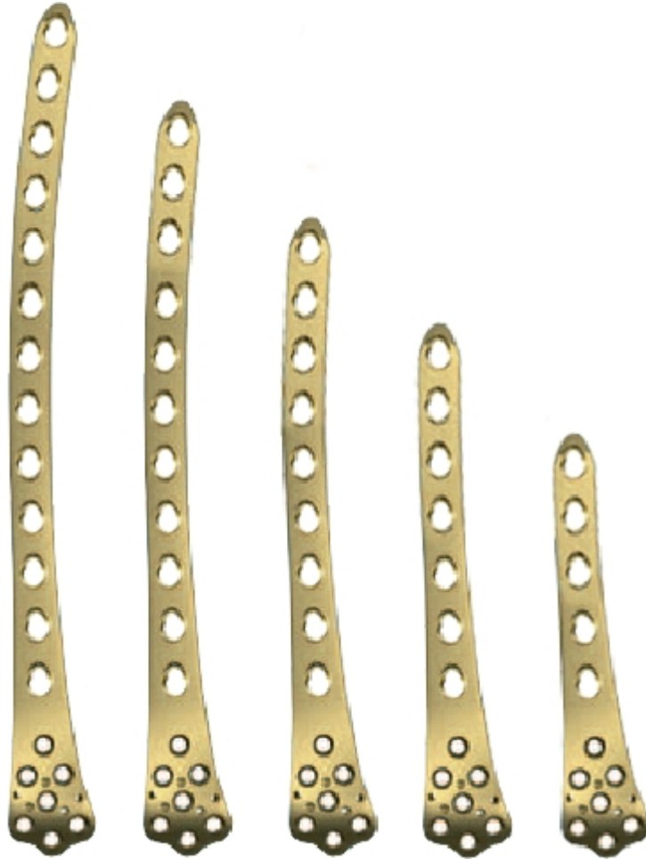
Comlok® Distal Lateral Femur Plate 4.5/5.0mm, Left